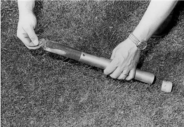
A sample is removed from the tube

Prior to hoisting the apparatus, it is turned half a turn clockwise to break the sample from the subsoil. It is advised to pull out right turning. The push/pull handle is very useful in pulling out the sampler.