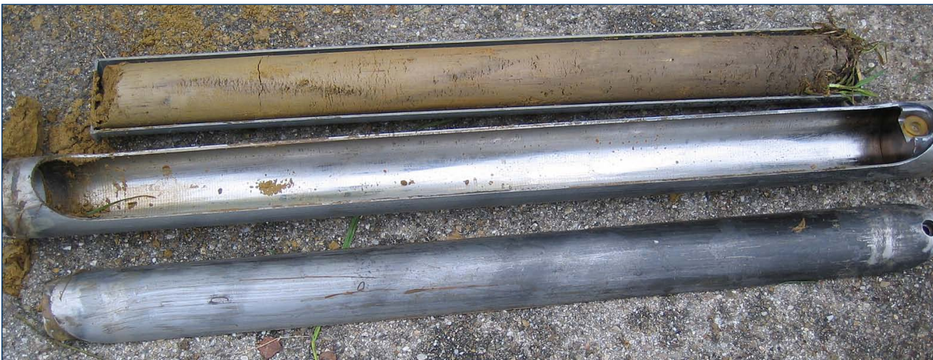
Soil column cylinder, removable lid and sample in sample gutter

Nothing in this publication may be reproduced and/or made public by means of print, photocopy, microfilm or any other means without previous written permission from Eijkelkamp Agrisearch Equipment.