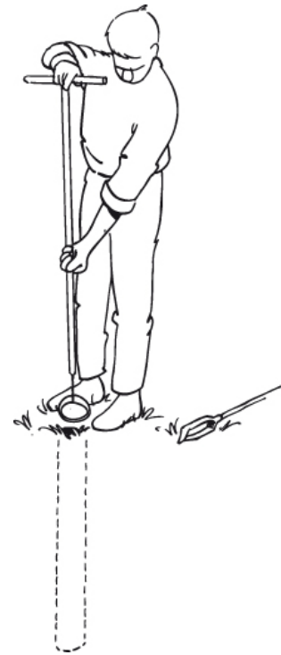
The cutting shoe is removed from the borehole.